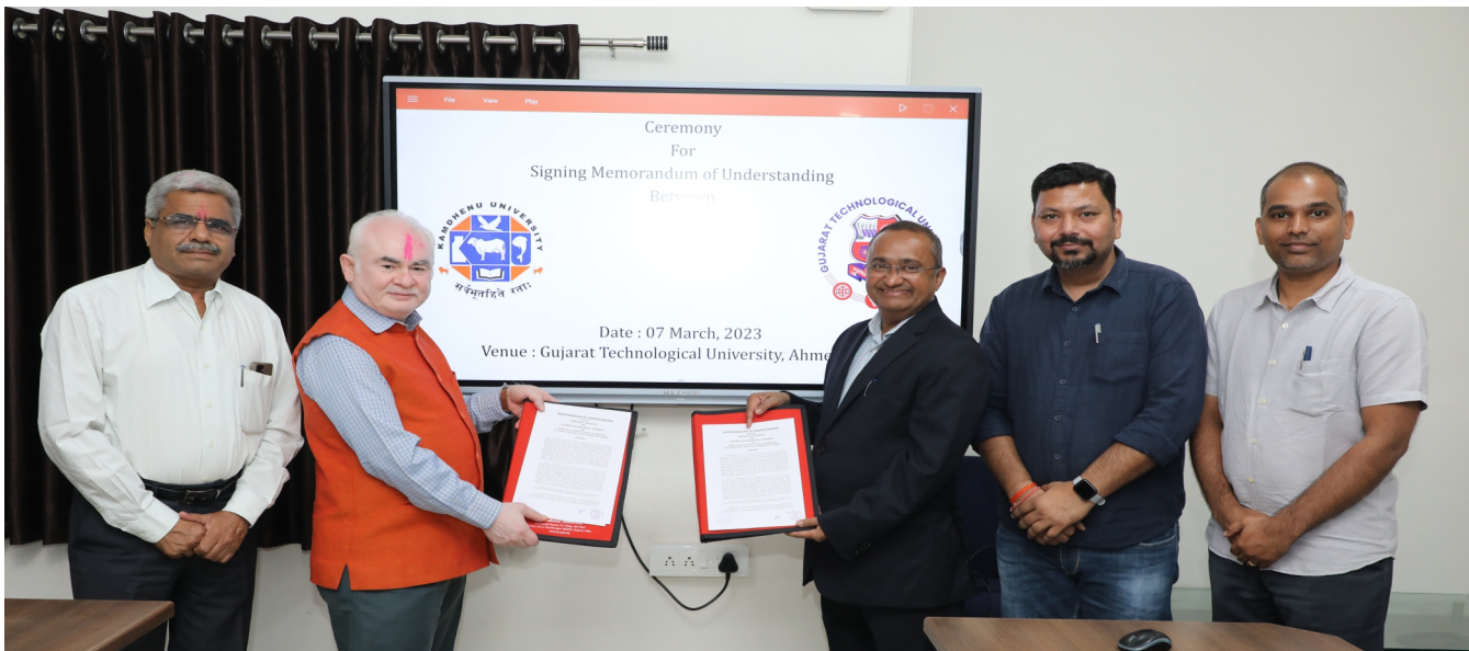
GTU Signed MoU with Kamdhenu University on 07 th March 2023