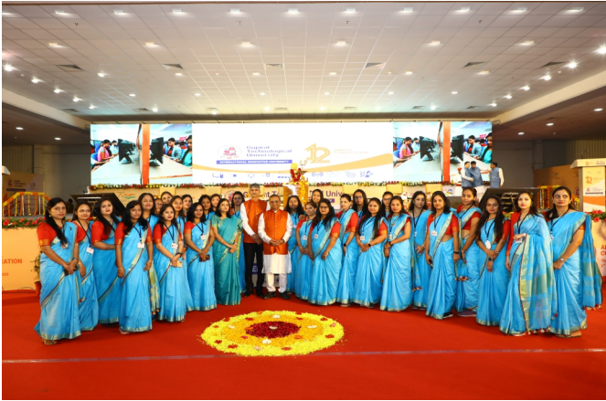
12 th Convocation 2023