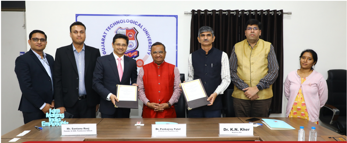
GTU signed MoU with Teamlease Edtech Ltd. on 24 th January 2023