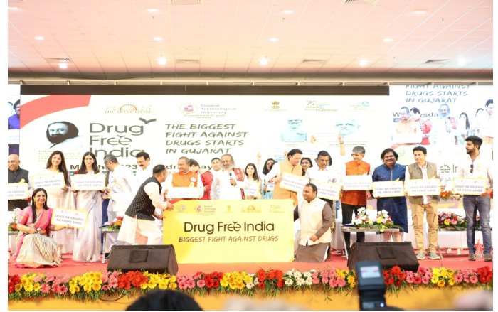
Drug Free India Campaign