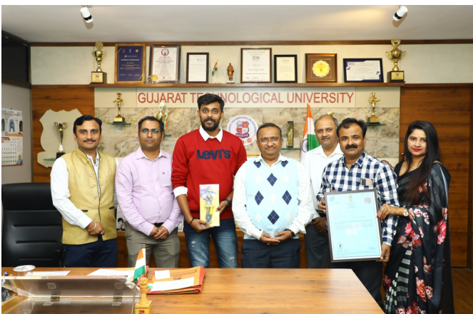
GTU Incubated Start-Up CPM Industries got their Patent Granted and selected for Start-Up Canada Program