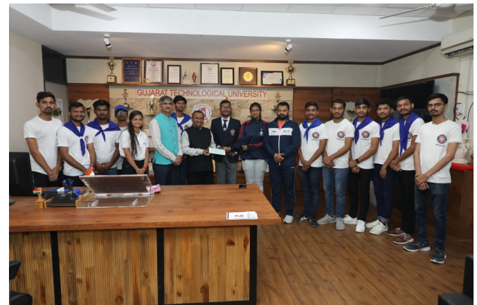
Sainik Welfare Fund 2023