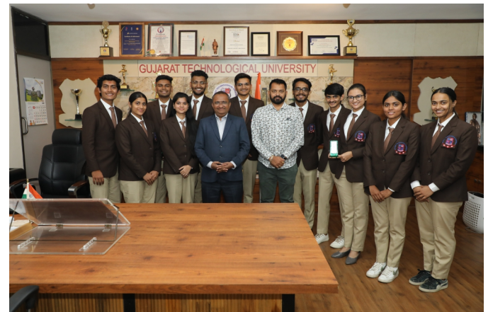
West Zone Youth Festival Team -2023